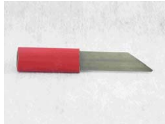
Ultra-Thin Parting Tool

Please add $5.00 Shipping and Handling to your order (no matter the number of items ordered being shipped to the same address at the same time).