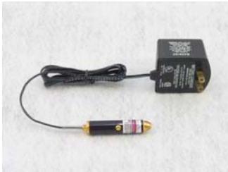
110 VAC Laser Pointer